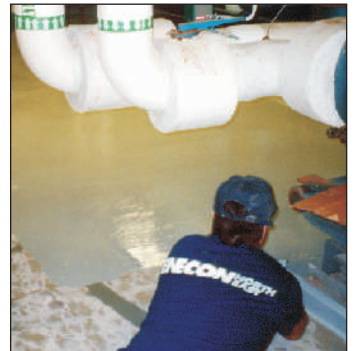
SuperBond is an excellent bonding agent for almost any flooring material.

SuperBond can even be used as a bonding agent for permanent immersion applications such as in swimming pools or on ships' hulls. It cures chemically, transforming the bond-line into a highly durable, waterproof film.