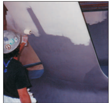
SuperBond is ideal for immersion applications.